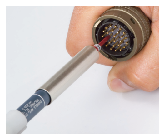
Typical application showing tool testing pin contacts.

The quality assurance test most often overlooked is contact retention (proper seating of power contacts). This important test can now be performed simply and in a matter of seconds with the DMC retention testing tools for power conatcts.