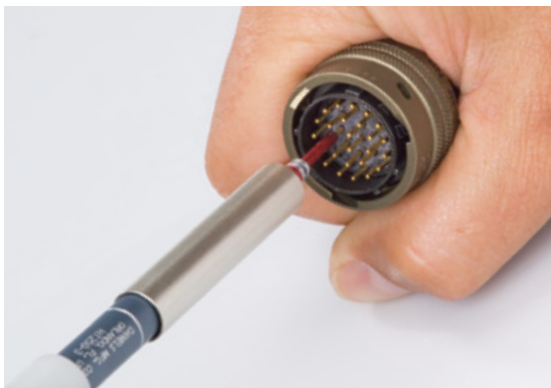
Typical application of tool testing a pin contact