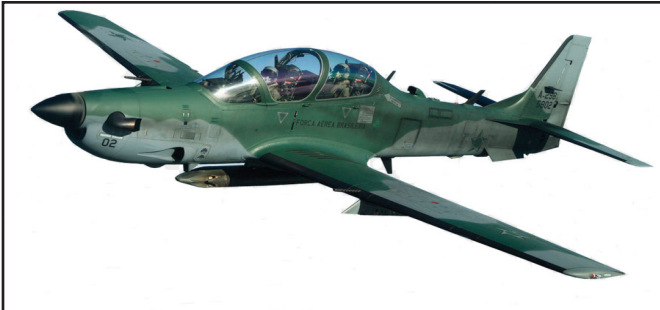
DMC775 for the Embraer EMB-312 Tucano