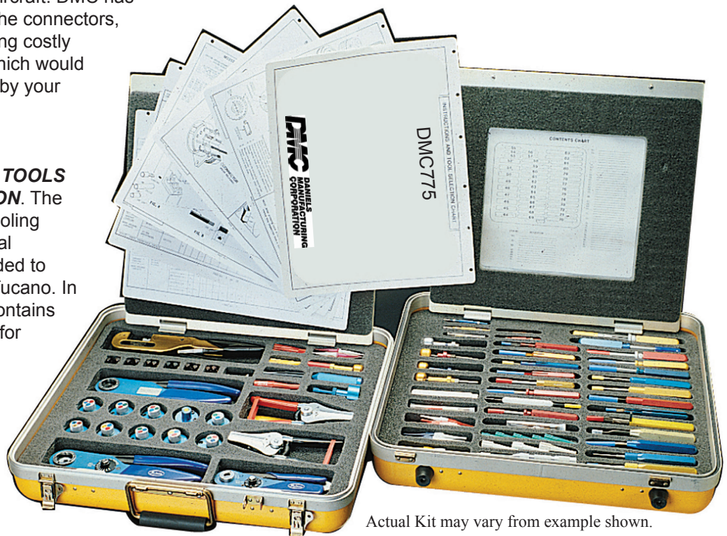
Actual Kit may vary from example shown.

ALL IN ONE. Since all of these tools, together with their operating instructions, are contained in a single kit, the connector repair can be made in the shortest time possible, thus permitting a rapid return of your aircraft to service.