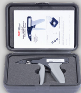
DLT-1100 LaceLok Installation Tool

The DLT-1100 LaceLok installation tool applies 20 lbs (+/- 2 lbs) of tension to consistently produce reliable lace terminations. It also reduces operator fatigue and repetitive motion injuries common with other secondary support methods.