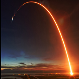
Launch Vehicles and Systems