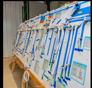
Connector and Wire Harness Assembly