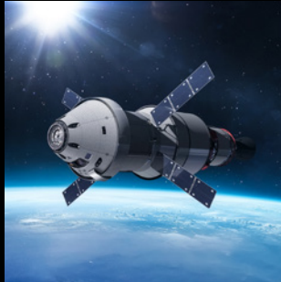
Spacecraft and Space Vehicles