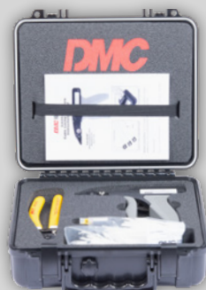
DMC2300-10NA1 LaceLok Starter Kit

The DMC2300-10NA1 is a starter kit that provides all the necessary items to properly install LaceLok. It includes an installation tool, guarded cutters, a replacement blade, and 100 pieces of LaceLok (LF2-10NA1).