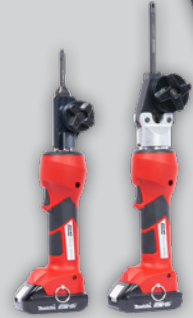
SCTE323C & SCTE625C

Battery-powered Safe-T-Cable tools allow operators to adjust tension and use next-gen technology to track tool performance, users, and projects. Crimp data is viewable in real-time on the LED display, or can be downloaded via Bluetooth® to an app.