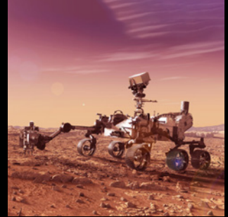
Ground Support Equipment