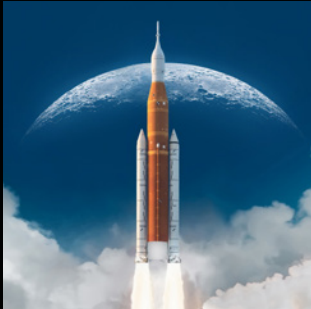
Rockets, Carrier Rocket