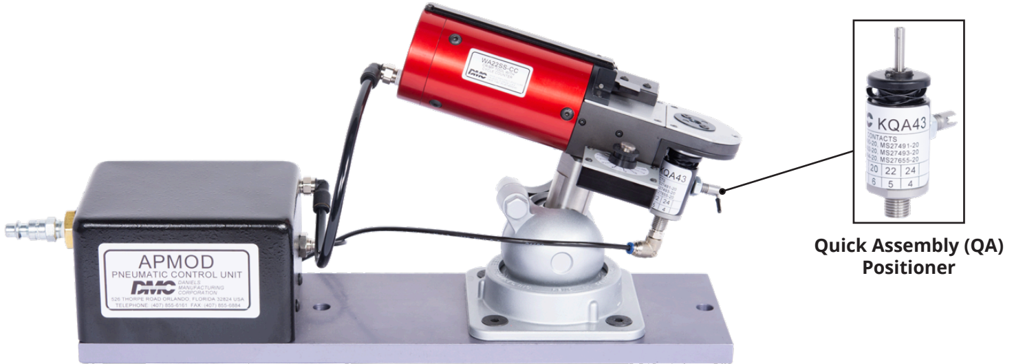
Pictured: APMOD, KQA43, & WA22SS-CC

The APMOD, automatic positioner crimp system enhances DMC®'s pneumatic crimp tool's capabilities by allowing users to actuate a pneumatic crimp tool without pressing a trigger or using a foot pedal.