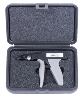
DLT-1100 (M32555/01-01) Installation tool only